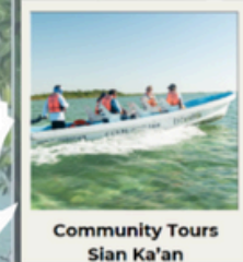
Community Tours Sian Ka'an